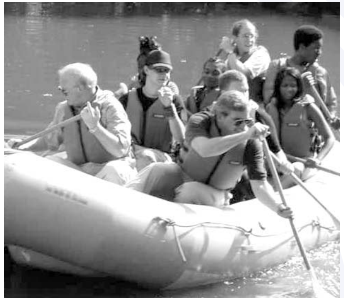
Mayor David Armstrong, accompanied by students and teachers from Liberty High School, takes new rubber rafts on an inaugural cruise along Beargrass Creek to the Ohio River. The rafts were purchased with the help of $8,000 from MSD as part of an environmental education project with local schools to promote protection and recreational use of Beargrass Creek.

install a screening system at the Beargrass Creek pumping station later this year. The new system will remove trash and debris floating in