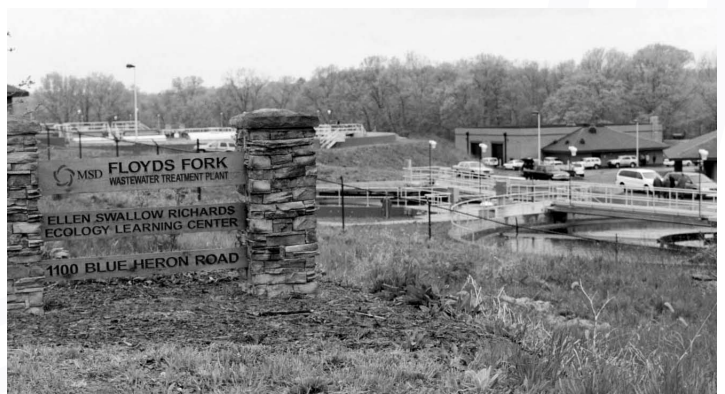
MSD's Floyds Fork Wastewater Treatment Plant was recognized as the utility Project of the Year by the Kentucky Chapter of the American Public Works Association.

In addition to the capacity to treat up to 3.25 million gallons of wastewater daily, the Floyds Fork facility includes an ecology learning center and is accessible to persons with physical handicaps.