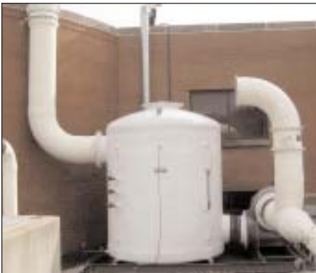
Carbon adsorption is used at the Jeffersontown plant. The process physically adsorbs odor-causing compounds from wastewater treatment processes.

About $280,000 has been spent to-date, to reduce order and make the plant less noticeable to neighbors, according to MSD's Project Manager Sharon Worley. In 2001 MSD voluntarily initiated an odor control master plan for all major wastewater treatment plants. Information from this study was used to identify other odor sources. A project is currently underway to address these odors.