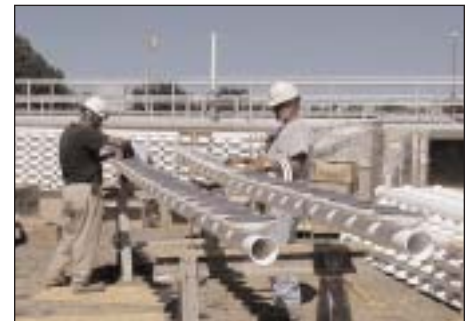
Improvements at West County include new aeration processes that enhance treatment and reduce odor.

This latest expansion will increase the plant's capacity to 30 million gallons a day and is expected to be completed in 2005.