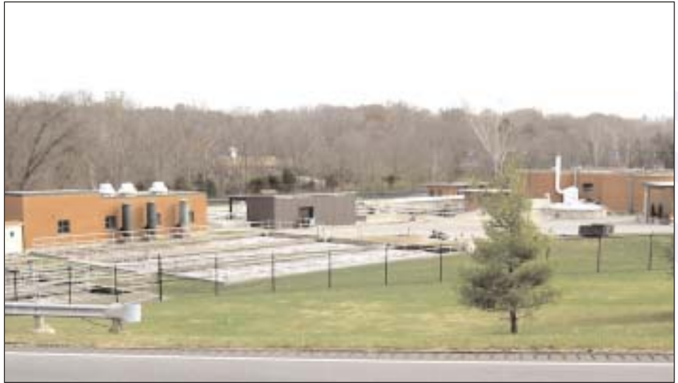
Located on Old Taylorsville Road, the Jeffersontown plant was isolated when it was built in the mid-1950s but now has business and residential neighbors.

Since MSD purchased the plant in 1990, making the plant less of a nuisance to neighbors has been an issue. On November 20, odor control plans that are in place at the plant and those planned were detailed at a public meeting at Jeffersontown City Hall.