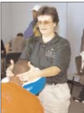
Free massages are among Expo features.