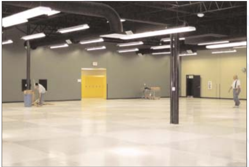
Workers prepare the new facility for the staff.