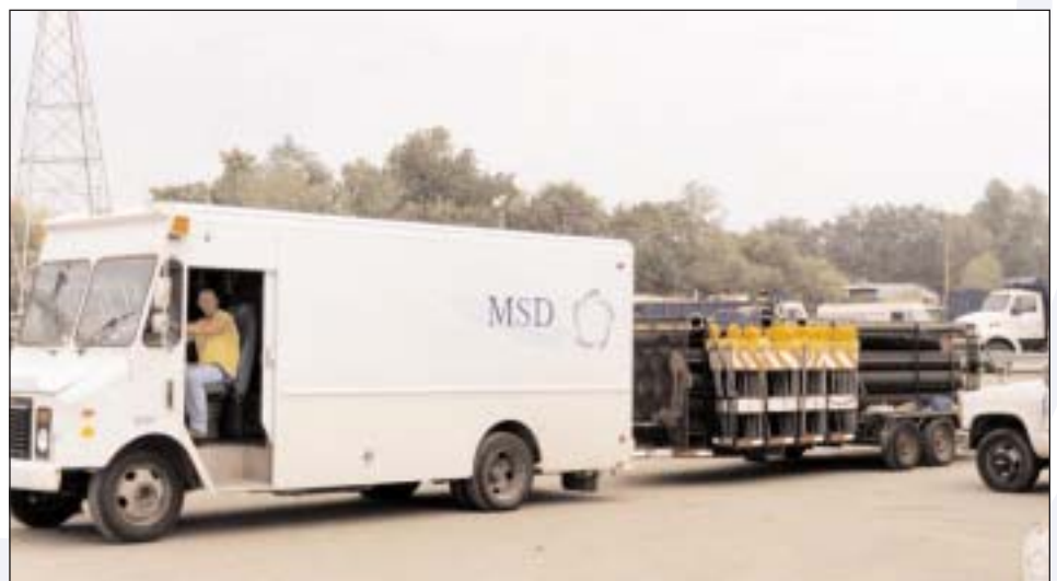
BELOW: Equipment from Cabel Street is packed to move.