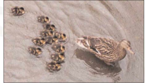
A mother Mallard duck leads her ducklings through the South Fork of Beargrass Creek restored by students.

“The grant has given us a great start on a project that will continue providing students a learning experience that benefits the community.”