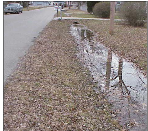
Homes along Tile Factory Lane will see roadside drainage relief thanks to Project DRI, the Metro government/MSD initiative to address the community's worst drainage problems.