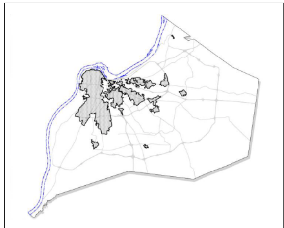
Backflow prevention devices are available to customers in sewer overflow areas (shaded on map).

Akridge said customer requests for Plumbing Modification services received before July 1 will be honored. Requests made after July 1 will be screened and prioritized based on the new criteria.