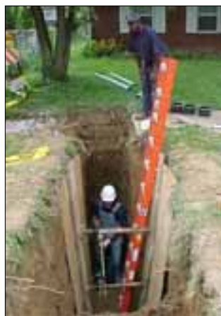
Installing new sewer lines in an excavated trench is now safer for MSD workers with new bracing equipment that is lightweight and may be installed from ground level instead of from inside the trench.

MSD will soon be using lightweight equipment designed to enhance the safety of employees working in excavated trenches. The new equipment weighs less and may be assembled above the excavation, according to MSD Safety and Emergency Response Administrator Allen Adams.