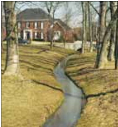
Drainage facilities like this will be maintained by MSD under an agreement with the City of Prospect to provide drainage services.