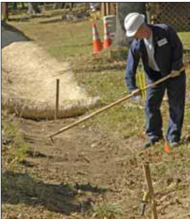
Mike Turner puts the final touches on ground restoration of a rear-yard DRI project.

Much of the work was performed by MSD crews and included constructing new culverts, regrading drainage channels and repairing storm sewers. MSD personnel also engineered and managed most of the projects.