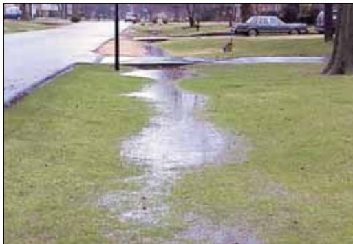
Now in Phase 2, Project DRI continues working across Louisville Metro to upgrade existing drainage facilities and build new ones.

Replacing driveway culverts and aprons, and installing a pipe and inlet system along Winston Avenue from Lowell Avenue to Kings Highway will relieve standing water along the road. The $98,630 project will resolve three drainage service requests and benefit an additional 40 properties.