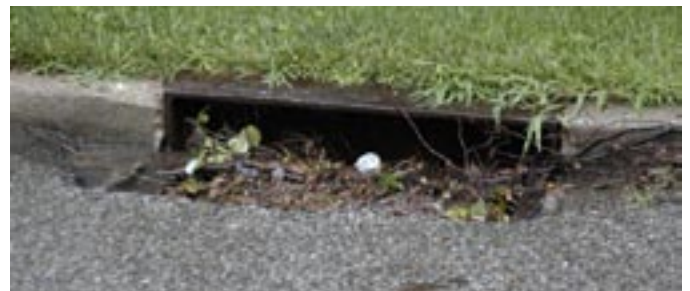
Drains that become blocked by yard debris can cause flooding problems in streets and homes.

Don't dispose of yard waste in storm drains and catch basins. Keeping these areas clear for proper drainage may help prevent flooding and make your neighborhood more beautiful.