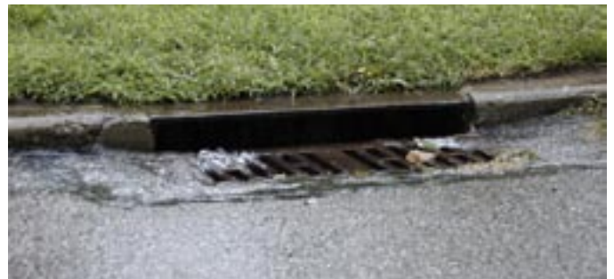
Maintaining storm drains and catch basins near your property will help prevent flooding.