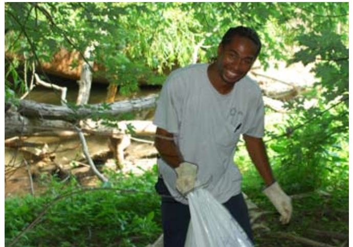
As the largest environmental event of its kind, the Ohio River Sweep joins more than 15,000 volunteers in six states.

For the 18th year, a cleanup campaign has united volunteers in six states to sweep trash from the Ohio River shores. The Ohio River Valley Water Sanitation Commission's Ohio River Sweep—sponsored locally by MSD and E.ON—involves more than 15,000 volunteers from Pittsburgh, Pennsylvania to Cairo, Illinois.