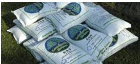
Louisville Green is an organic fertilizer available in 40 pound bags at home and garden stores.