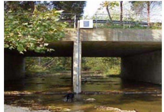
Data reported electronically from 24 stream monitoring locations in Louisville Metro allows MSD to quickly respond to changes in water quality.

The U.S. Geological Survey will collect, monitor, and analyze area stream water quality and other data. Since 1988, the partnership with USGS has allowed MSD to share labor costs and the cost of 24 monitors located throughout the Louisville Metro area. Data is reported to the Kentucky State Division of Water, the Environmental Protection Agency and environmental groups such as the Friends of Beargrass Creek, Salt River Watershed Watch and local universities.