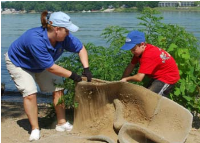
Volunteers retrieve carpeting and other litter as part of the Ohio River Sweep on June 16.

For the 18th year, a cleanup campaign has united volunteers in six states to sweep trash from the Ohio River shores. The Ohio River Valley Water Sanitation Commission's Ohio River Sweep—sponsored locally by MSD and E.ON—involves more than 15,000 volunteers from Pittsburgh, Pennsylvania to Cairo, Illinois.