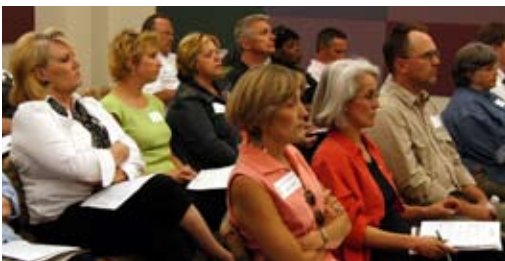
Guests at the Kentuckiana Girl Scouts public meeting location learned how MSD works to improve sewer infrastructure and increase water quality through Project WIN.

After holding five Project WIN meetings in recent months — from downtown, to Okolona, to Middletown — an additional meeting has been added for June 11 at the Southwest Government Center.