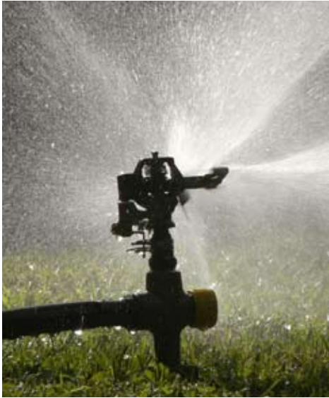
A ten percent drought credit will appear on residential customer bills for water used to irrigate lawns.