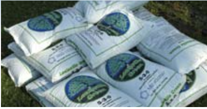
Louisville Green, a fertilizer produced at MSD, was featured on local television channel WDRB-TV in March.

Louisville Green, the fertilizer product produced at MSD's Morris Forman Wastewater Treatment Plant was featured on a WDRB-TV morning television show in March. The timely news piece aired to promote the spring fertilizing season during April and May.