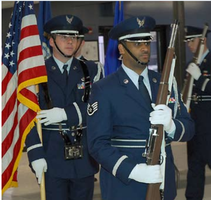
The color guard presented the flag during the MSD Veterans Day celebration.