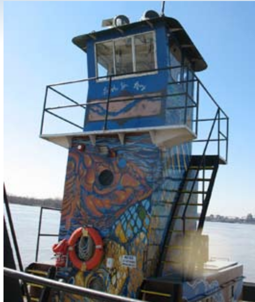
A towboat serves as a floating classroom for participants in Living Lands and Waters' Big River Educational Workshops.